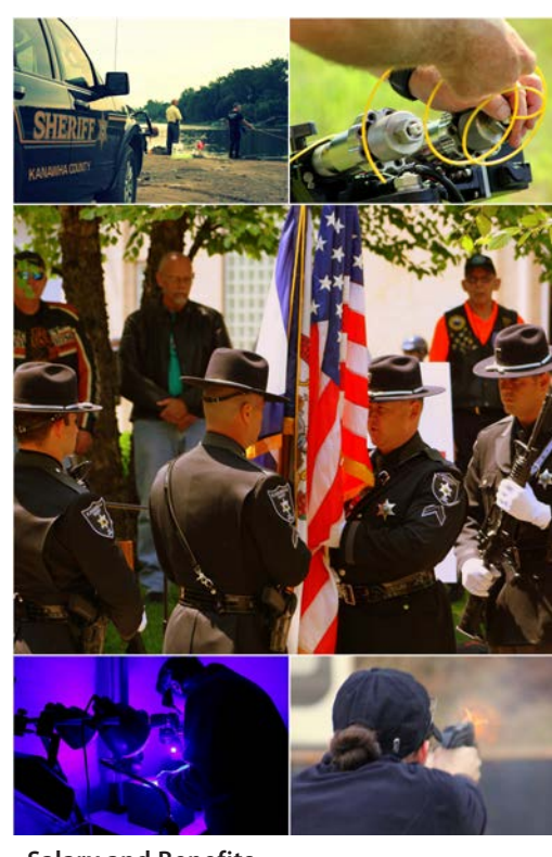
Salary and Benefits

The Kanawha County Sheriff's Office has salaries and benefits among the highest in the State. You may phone 304-357-0216 for updated information on rates of pay, and 304-357-0295 for a description of available benefits.